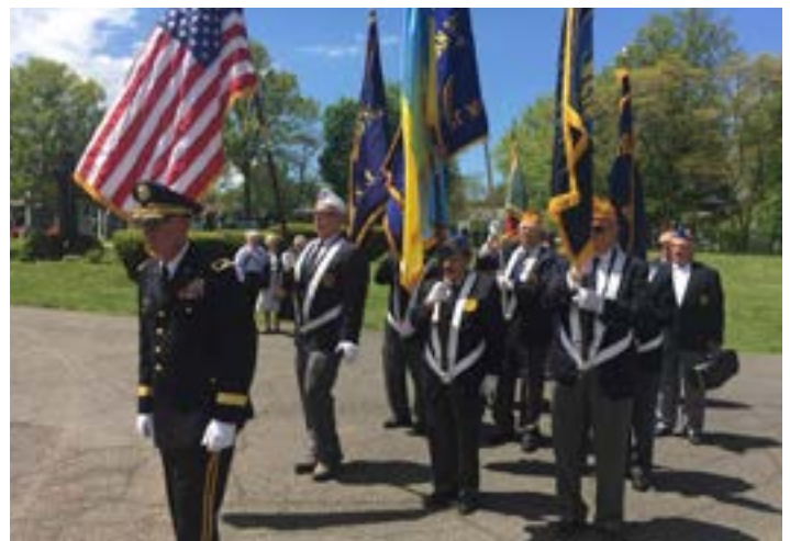
UAV Color Guard