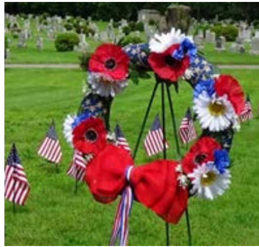
St. Mary's Cemetery