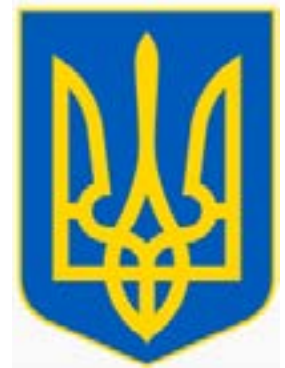
Ukraine Coat of Arms

You can watch the 25th anniversary parade in Kyiv, at www.youtube.com/watch?v=1EBp3EyuaBE