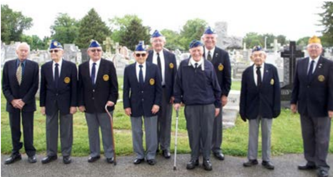
A few good men of Post #1