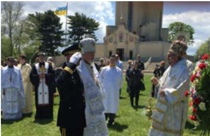
Wreath laying ceremony