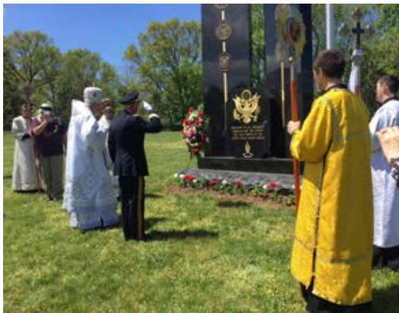
Wreath laying ceremony