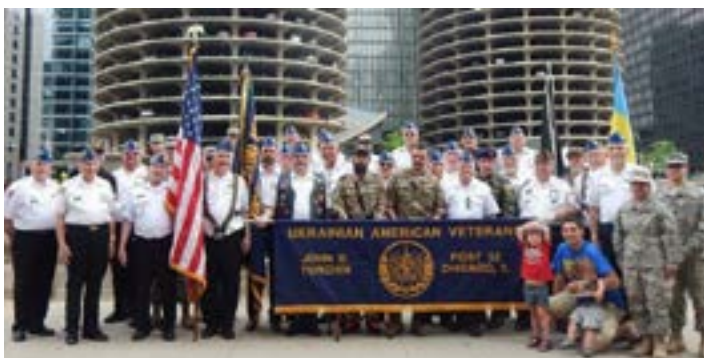
Group photo with everyone who participated in the Memorial Day Parade, with Marina Twin Towers in the background.