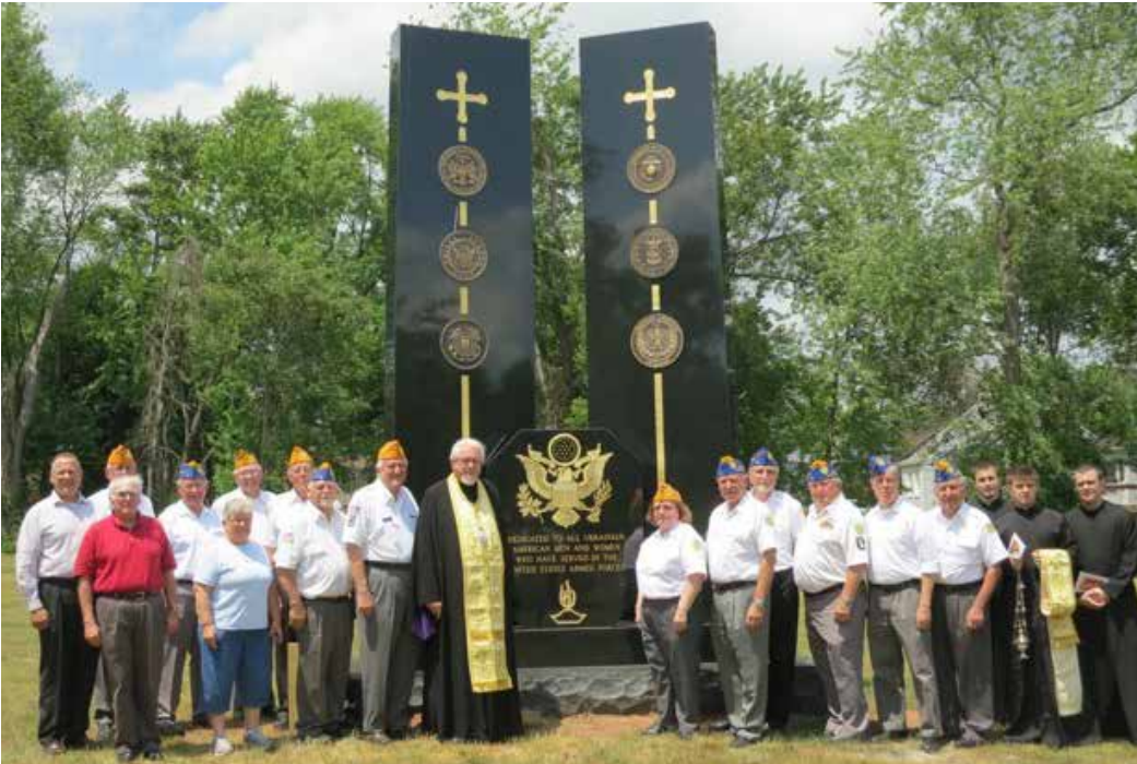
Metropolitan Antony of UOC of USA officiating