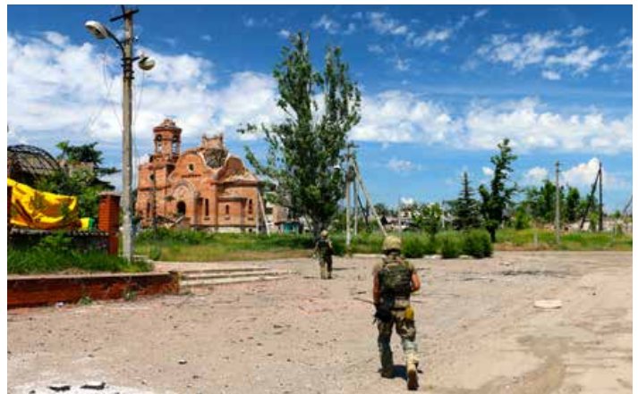
Ukrainian soldiers on patrol

Thank you Nolan Peterson and The Daily Signal.