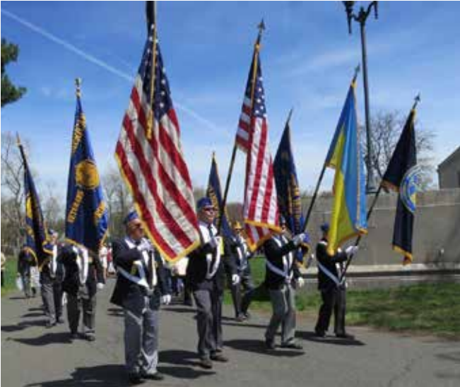
At the site of the UAV National Monument