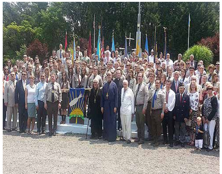
July 5, 2015