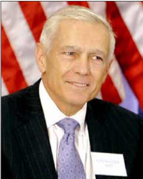
General Wesley Clark, USA (ret.)