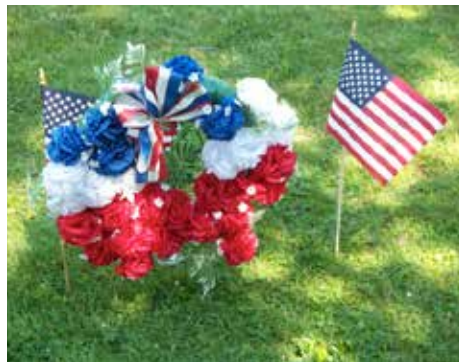
Wreath for the deceased veterans