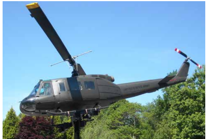
A New exhibit at NJ Vietnam Veterans Memorial: Restored Vietnam Era Huey helicopter