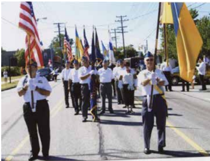
On Aug. 24, 2013 the Ukrainian village Parade held its 4th annual Ukrainian Independence Day in Parma. Our Post 24 veterans were honored as the parade's first grand marshalls. We had over 60 organizations including three band and various veteran groups that participated.

August 24, 2013. Post 24 members participated in the 4th Annual Ukrainian Independence Day parade, which was organized by the Ukrainian Village Committee and was held at the Ukrainian Village in Parma, Ohio. Over sixty organizations, including three bands and various veteran groups, also participated in this event. UAV Post 24 veterans were honored as the parade's first Grand Marshalls. Plans are in the making for the 5th Annual Ukrainian Independence Day parade to be held this year.