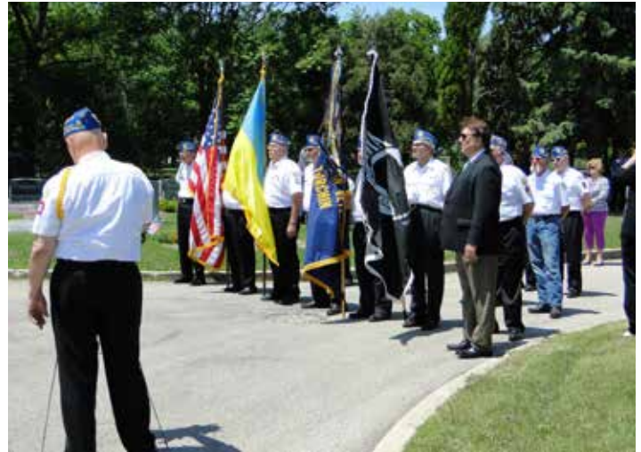
UAV Post 32 members attend the Zeleny Swiata service at St. Nicholas Cemetery.

nian veterans. At one time, there were more than 150 of these Ukrainian veterans of WWII; their number has now dwindled to 2 or 3, and they are unable to continue this noble practice. These veterans noticed all the work members of Post 32 do as we prepare to decorate gravesites on Memorial Day; impressed, they asked if we would do the same for their members. We were glad to accommodate.