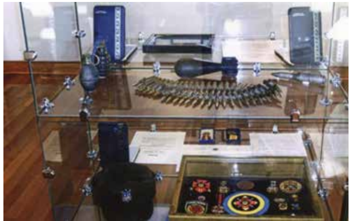
UAV Post 24 Military Exhibit had a successful showing from Nov 8, 2013 to Feb 15, 2014 at the Ukrainian Museum & Archives in Cleveland. Veteran pictures from WWII, Vietnam, Iraq & Afghanistan were exhibited, plus medals, uniforms, flags, painting and weapons, etc.

April 22-24, 2014, some of our members visited the Dayton Air Force Museum. In Dayton, Ohio, where airplanes from different eras were on display.