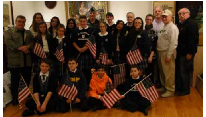
Group photo with St. Nicholas students.