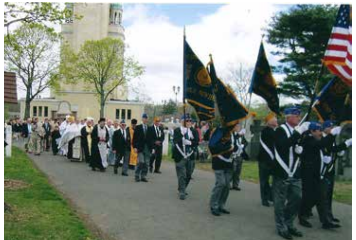
UAV Color Guard leads the procession.

After the services, the UAV Color Guard paid special homage at the UPA Memorial, ending their march at the future UAV National Monument site.