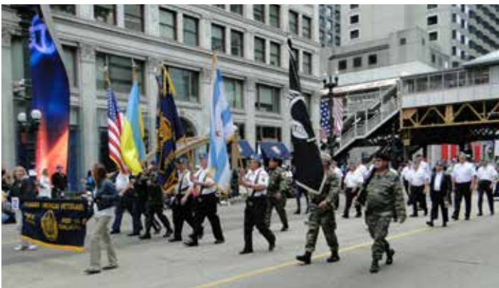
Ukrainian American Veterans Post 32 Chicago, march down the famous State Street the Great Street.