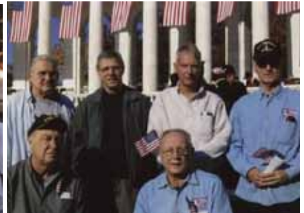
Post 24 members at Arlington National Cemetery Amphitheatre. Where President Obama spoke on Veterans Day.