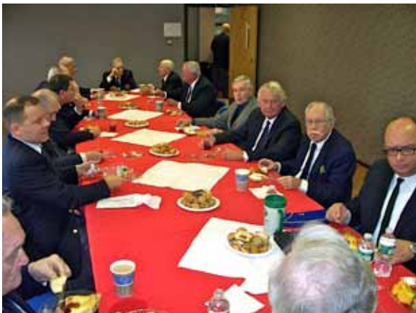
UAV Post 1 members during the reception.