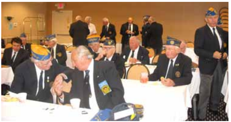
Delegates deliberating ...