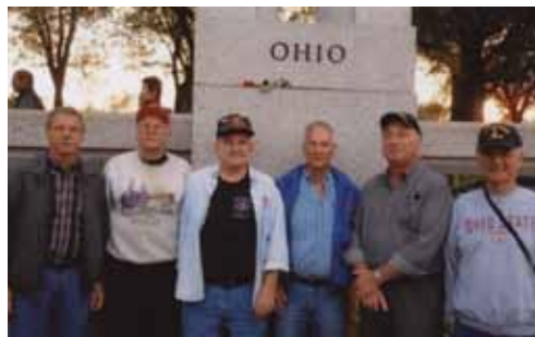
Post 24 members at the Ohio Memorial, at the WWII Memorial in Washington D.C. Nov. 10, 2012