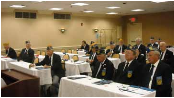
Delegates in session