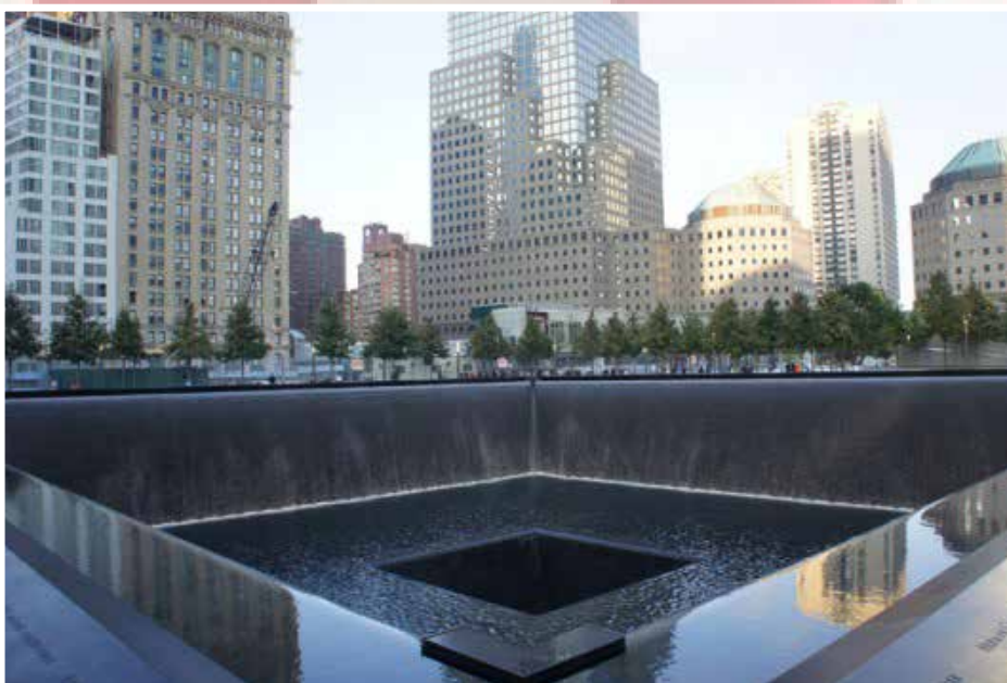
New York City