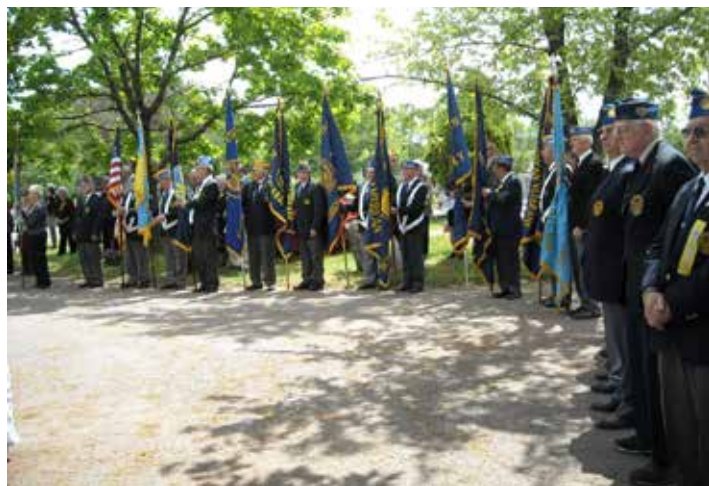
UAV Color Guard during Commemorative Services