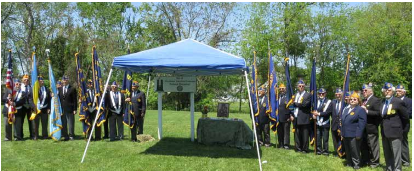
UAV members at the site of future UAV National Monument.