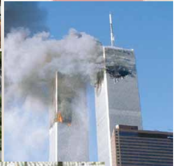
September 11, 2001