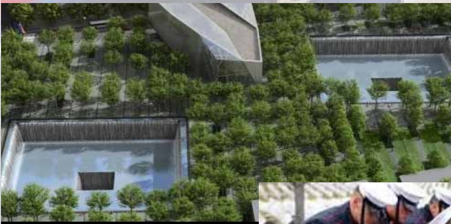
911 Memorial Rendering