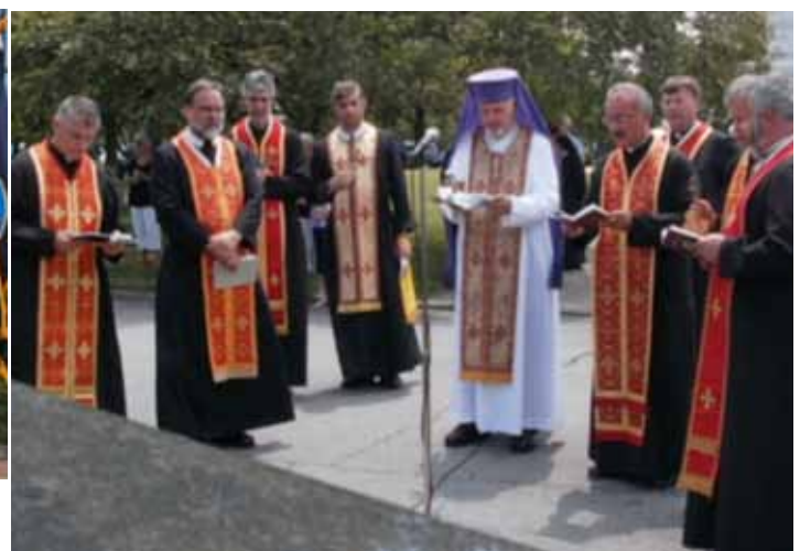
Bishop Emeritus Basil Losten with Stamford Eparchy clergy during Panakhyda