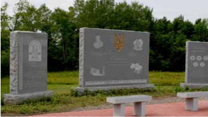
Newly blessed Ukrainian monument at St. Nicholas Ukrainian Cemetery in Amsterdam, New York

On May 6, 2012, a moving ceremony took place at St. Nicholas Ukrainian Cemetery in Amsterdam, NY, as a monument comprising of three solid granite slabs was blessed and dedicated in honor of all Ukrainian people who struggled to survive and fought for freedom in the old country and of the Ukrainian immigrants who toiled and struggled to make a new life in this country.