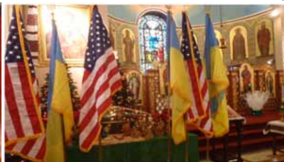
Flags ready to be blessed and donated to Holy Ghost UCC, Brooklyn, N.Y.