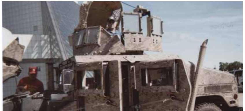
PC B. Samokyszyn in Marine Vehicle turret used in Iraq