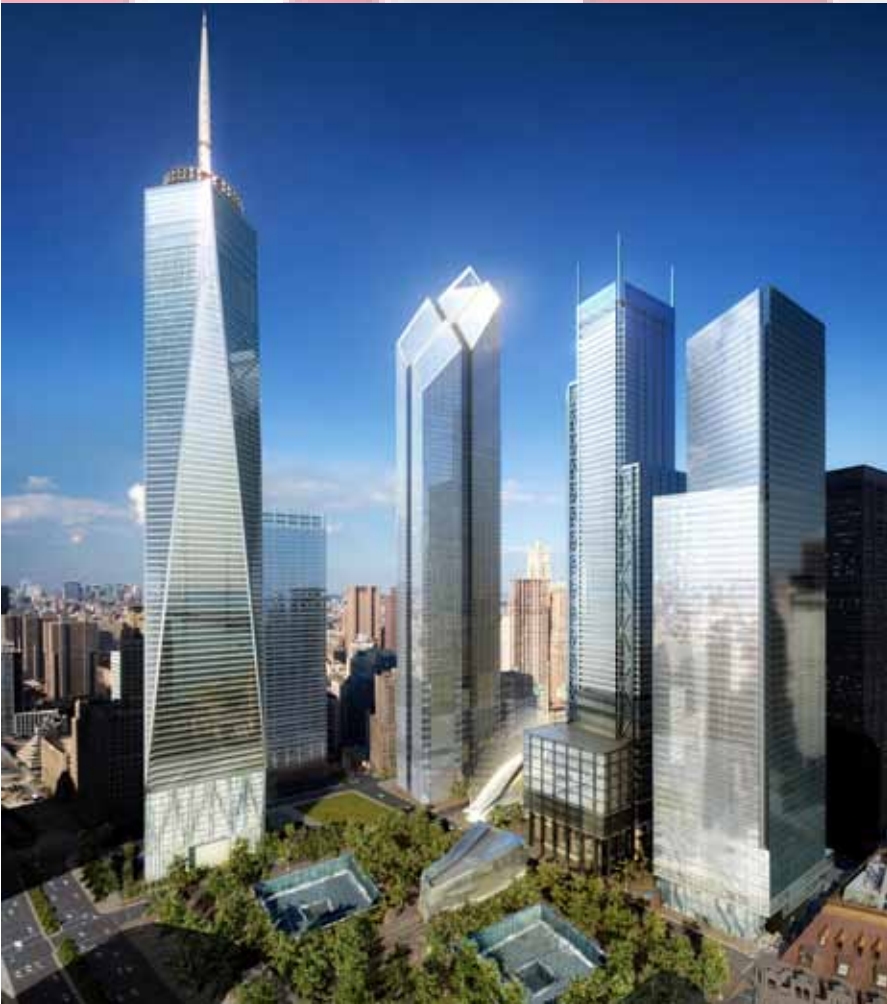
911 NYC, NY Memorial Rendering