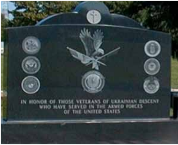
UAV Monument at Holy Spirit Ukrainian Catholic Cemetery, Hamptonburgh, N.Y. with walkway and plaques.