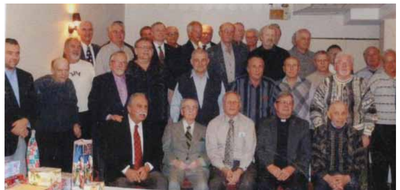
Post 24 members at Christmas Party on 12-18-11